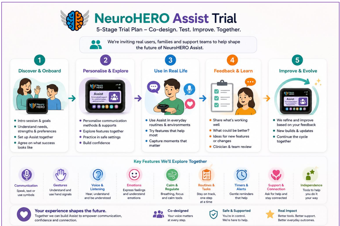
FIG-4: Planned Features Under Exploration

The design, trial and assessment aims to maximum capability from targeting practical use and benefits of NeuroHERO Assist in real-world settings - through feedback from participants, families, carers and clinicians.