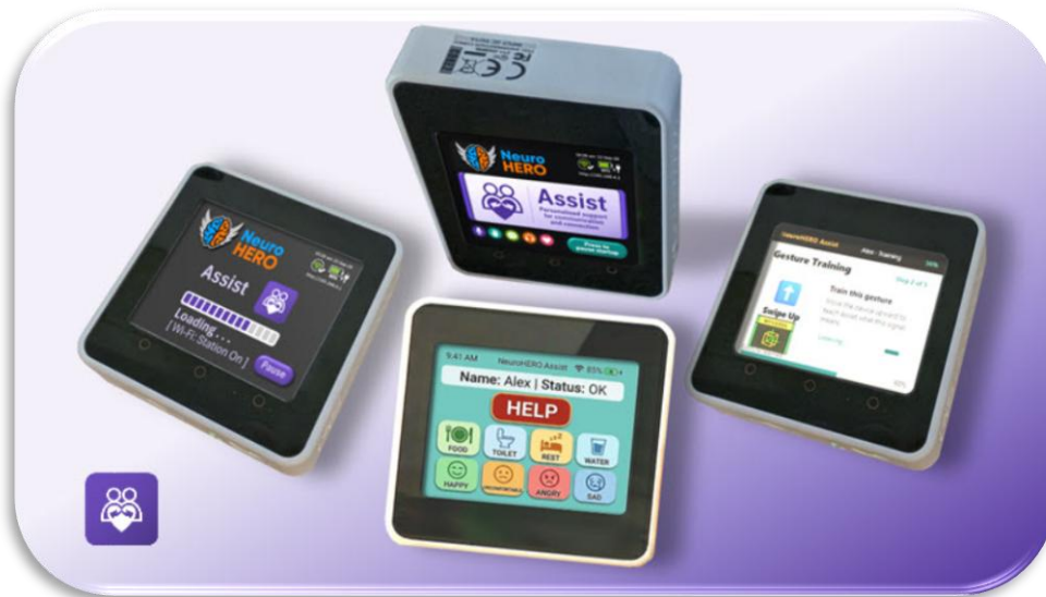
FIG-2: Current NeuroHERO Assist Prototype Devices (IoT ESP 32, M5-Stack Core-2)